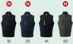
Master Men Page 270