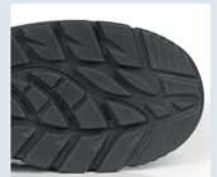
Steel High 58.134.10