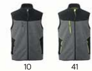
Panther Grey Vest 58.141