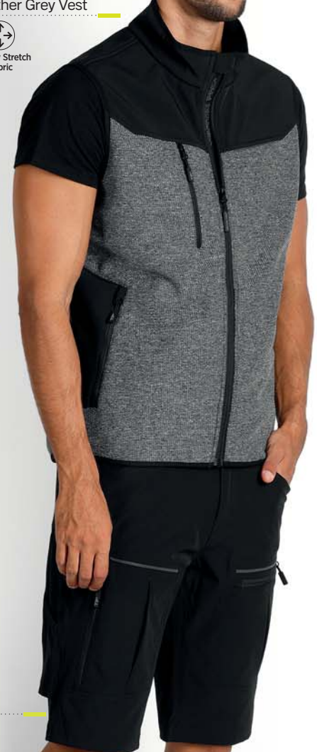
Panther Bermuda Page 319