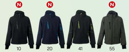
Panther Jacket 58.111