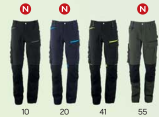
Panther Pants W 58.108