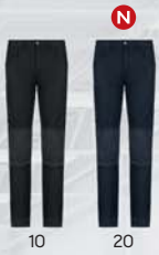
Target Men Page 271