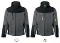
Panther Grey Jacket 58.140